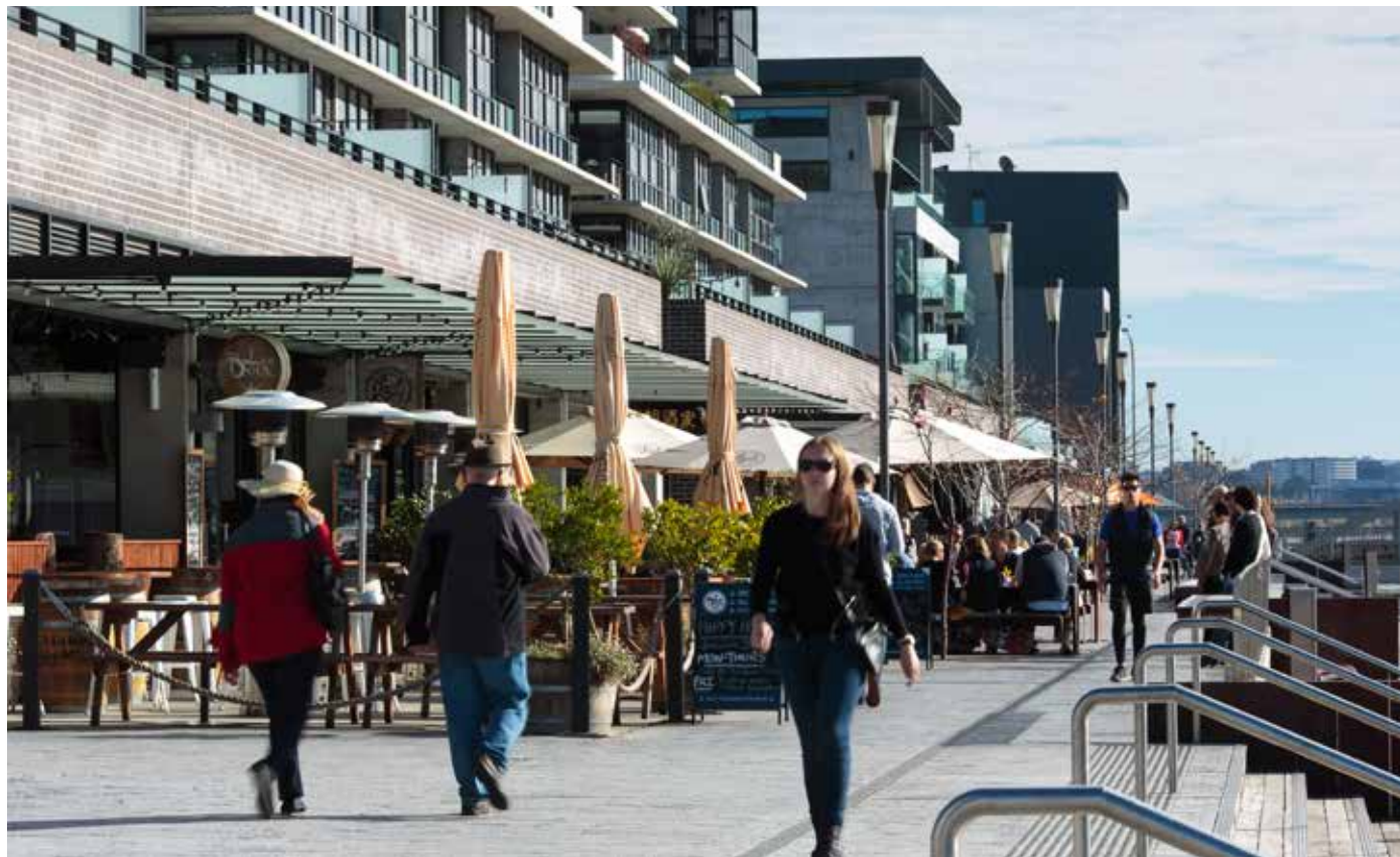
Dockside Apartments, Canberra