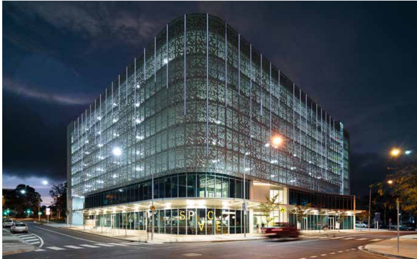
Skypark Carpark, Canberra